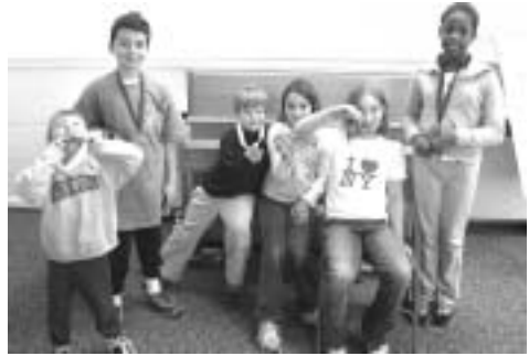
Winning Sap Bikers & Walkers With Medals

NonSaps Run, Walk, Bike...& Eat! In it's 18th year, the Sap Run came off without hitch,,,despite rather gloomy & chilly weather.