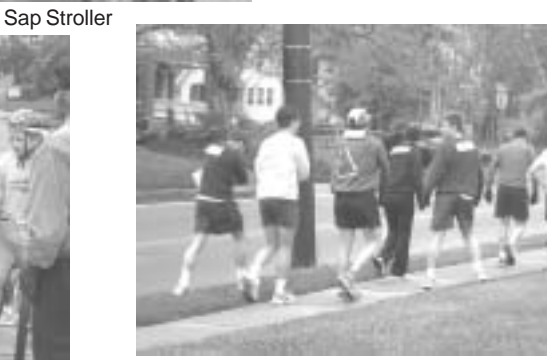
Sap Runners on their mark up Kennedy