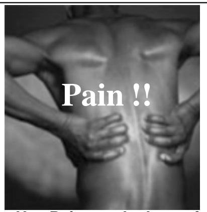
Has Pain got the best of you?

70% of all acute injuries turn into a chronic recurrent disorder after the first episode.