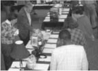
Browsing & Bidding