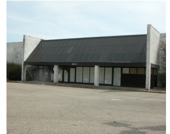
K-M Today Cultural Center Tomorrow