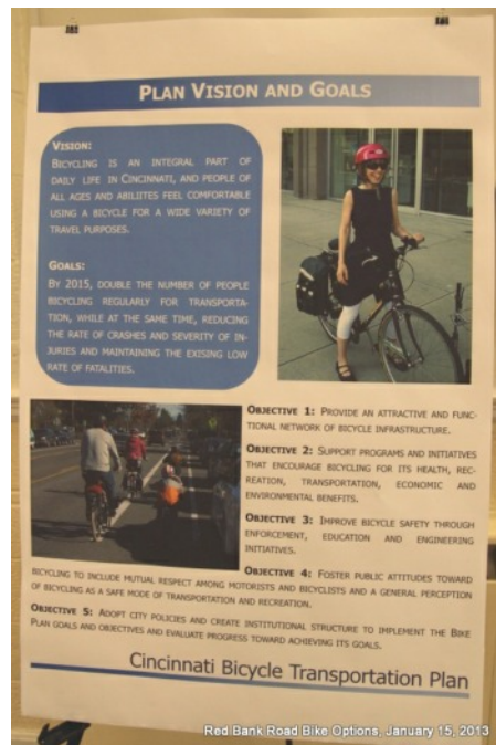
A poster showing the goals of bike lane installation in the City of Cincinnati.