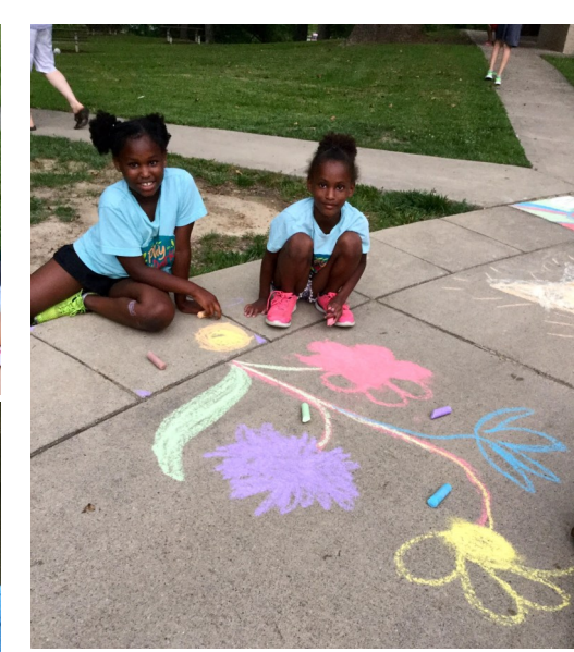
Photos of Play in the Park participants