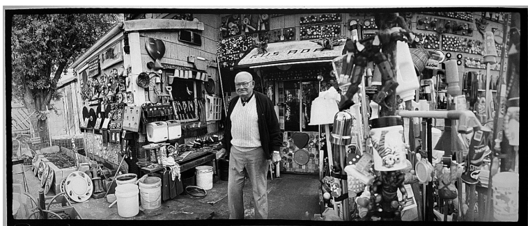
Image credit: Brad Smith, Junk Collector Louisville Kentucky, Widelux panorama camera – tri x film – black and white fiber print, 1998, 7.5 x 18 inches

Join Curators from Local Eyes as they share more about the exhibition theme, and a selection of exhibiting artists as they speak about their work.